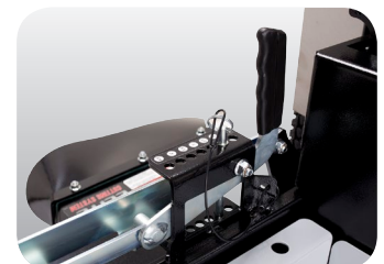
Quick-Lift – Easily raise the deck to avoid objects or lock deck for transport.