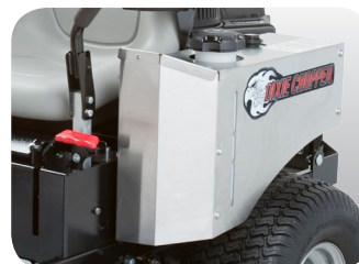
Stainless Steel – Protects fuel tank from sun and impact damage.