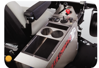
Tool Compartment – Convenient storage for drinks, tools, and more.