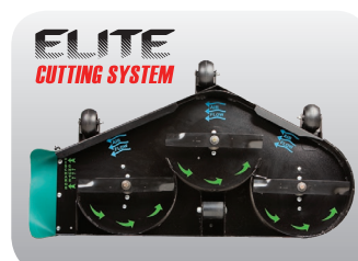
42", 48", and 54" Elite Cutting System – Formed and welded 10 ga deck shell.