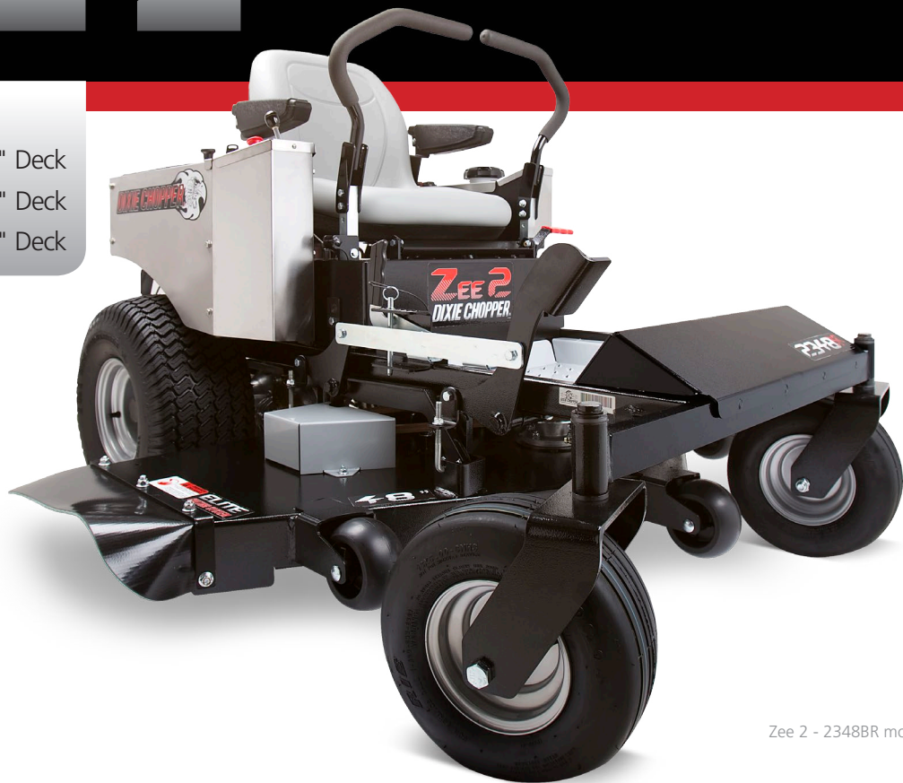
Zee 2 - 2348BR model shown*