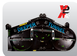
X2 "Wind Tunnel" Deck – Increases airflow and reduces build-up inside deck.