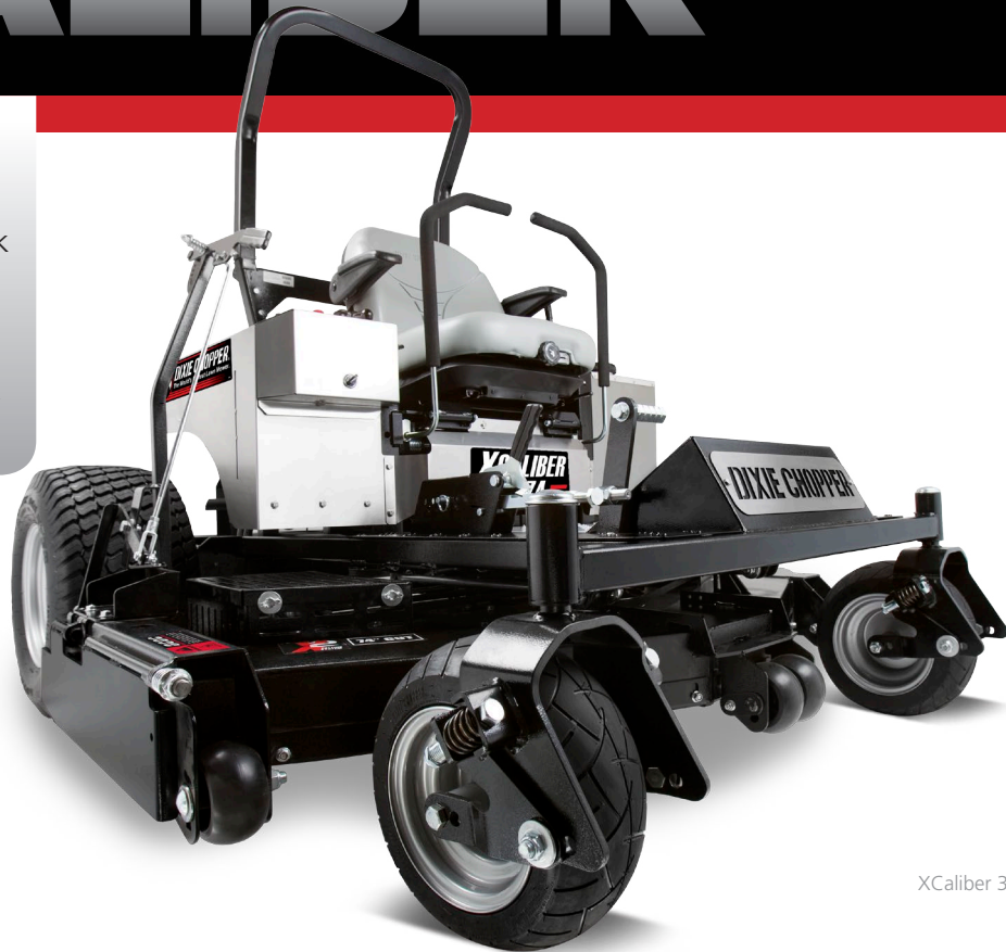
XCaliber 3574 shown*