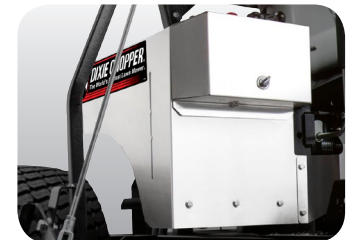
Two 7 Gallon Fuel Tanks – More fuel capacity eliminates frequent fill-ups.