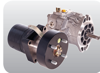
Pumps & Wheel Motors – Stronger transmissions for extended system life.