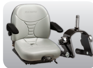
Total Comfort – Suspension seat and Springer Forks for best quality ride.