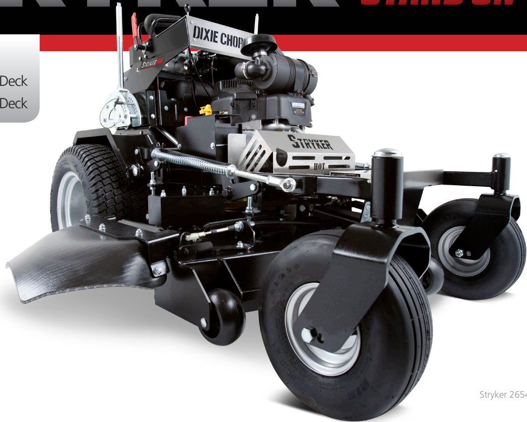
Stryker 2654 shown*