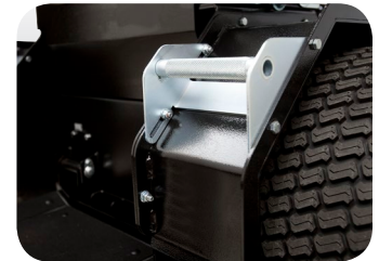
Hillside Footsteps – Keep your balance while accessing hillsides.