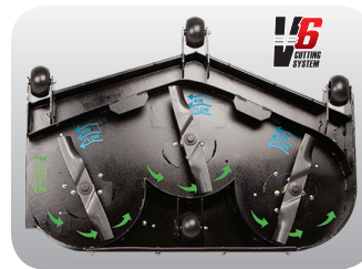
48" and 54" V6 Cutting System – Deeper deck for cutting thick grass.