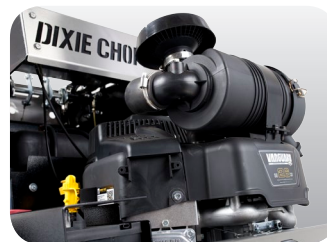
Vanguard® Engine – 26 horsepower commercial engine.