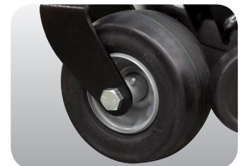
Service Access – Greaseable front wheels and spindles for easier maintenance.