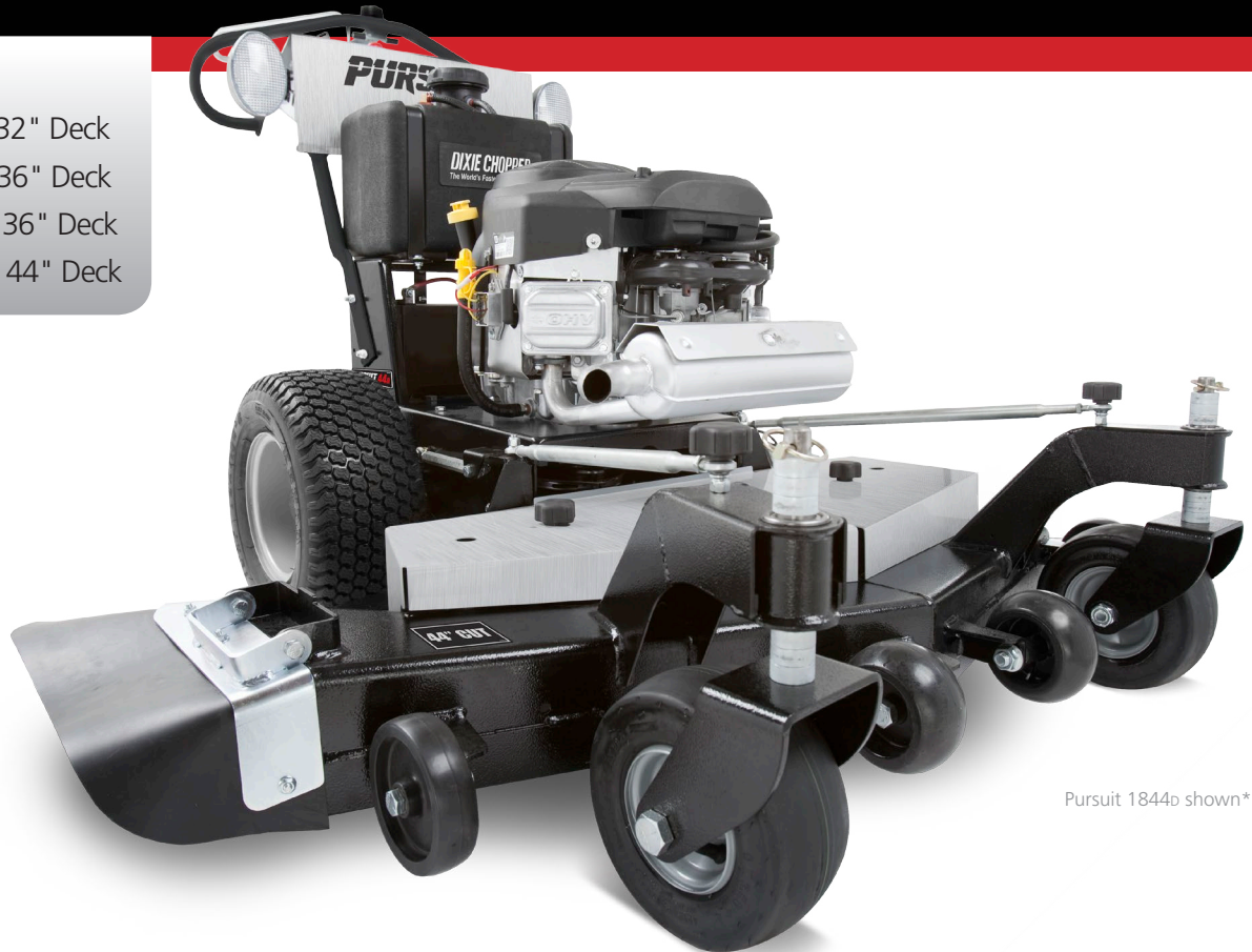
Pursuit 1844b shown*