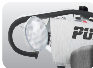
Light Kit – Standard on dual-drive models.