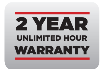
*unlimited hour limited warranty