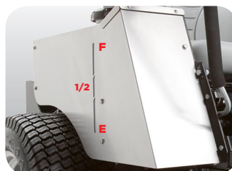
Fuel Sight – Check how much fuel is left in the tank without removing the cap.