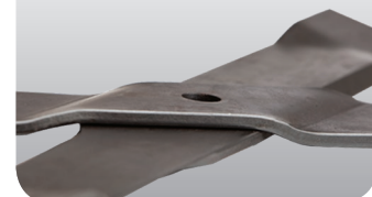
X-Blade Technology – Add a Twist blade for mulching effect.