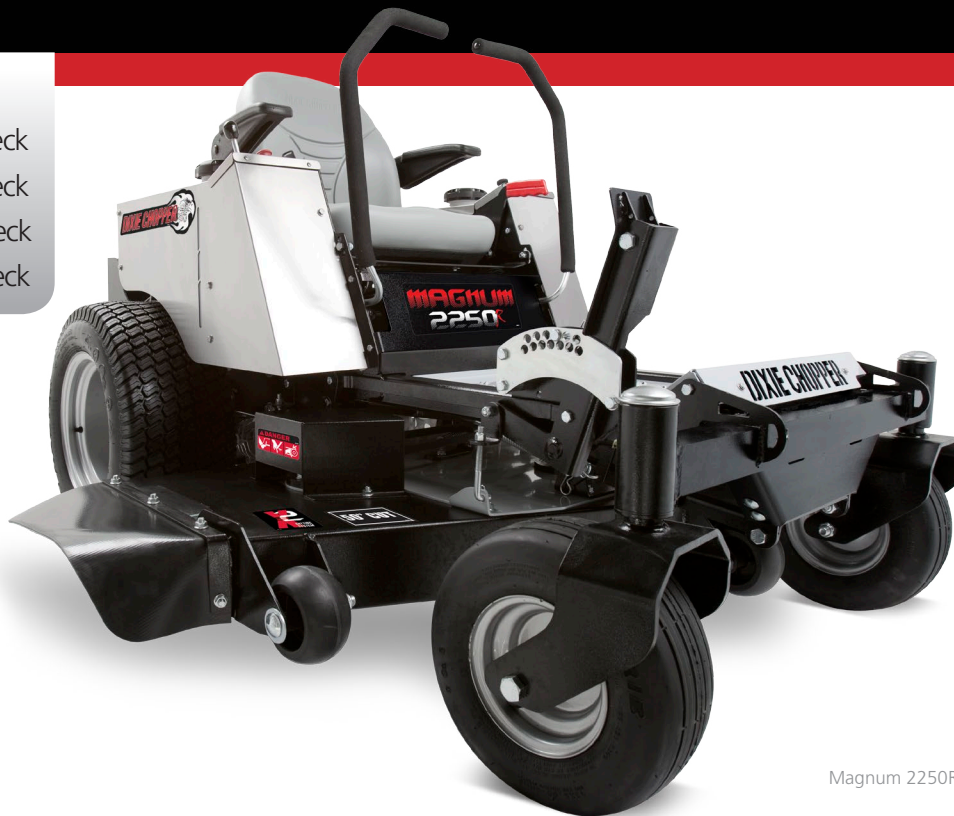
Magnum 2250R model shown*