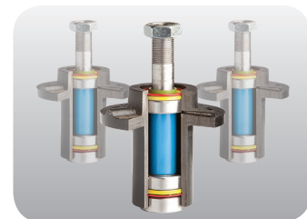
Heavy-Duty Spindles – Tried and true design for over 25 years.